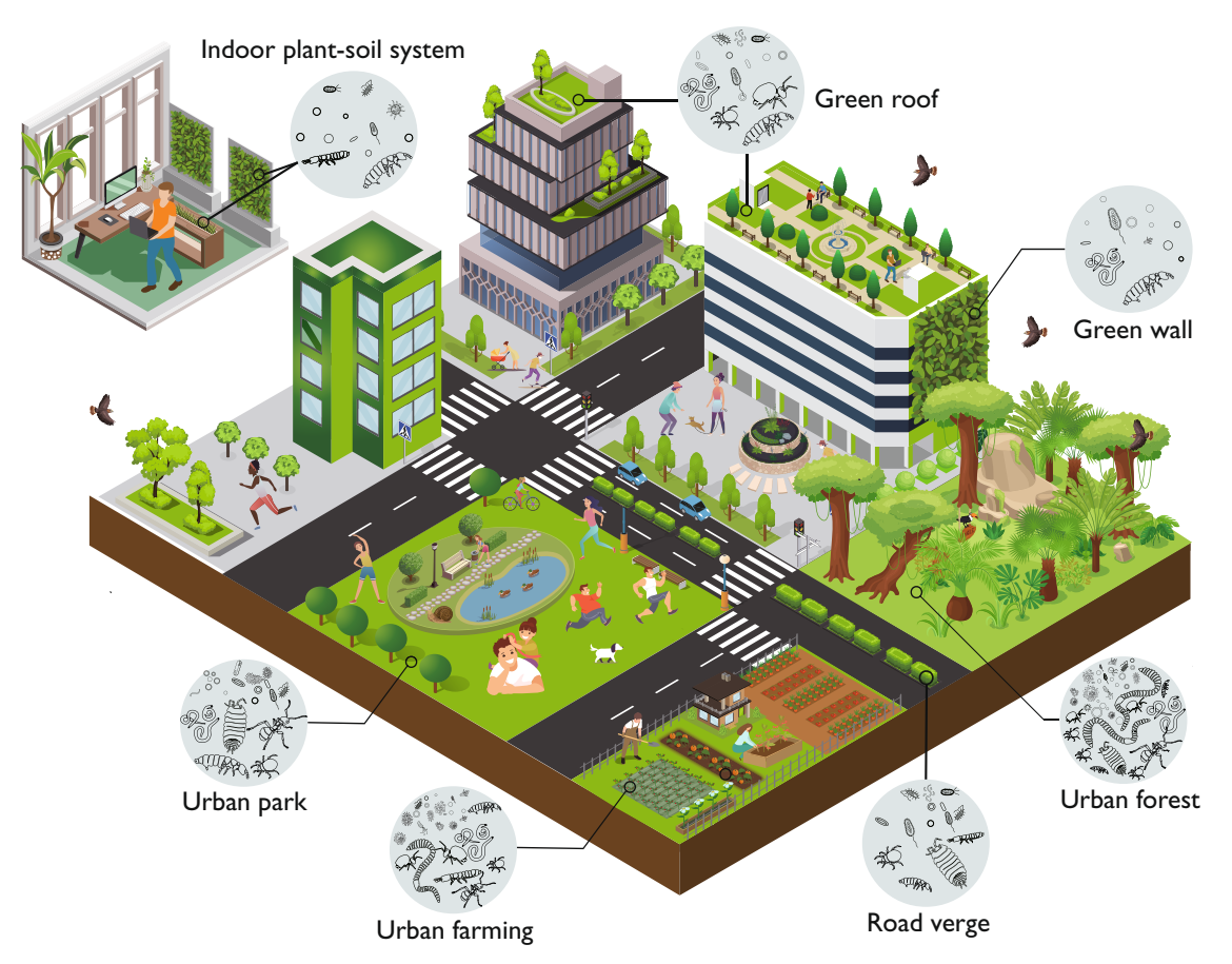
Fig. 1 Soil is a primary reservoir of biodiversity in urban ecosystems. Human-caused disturbance and loss of natural habitats greatly affect urban soil biodiversity. However, there are multiple mitigation options (e.g., green roofs and walls, indoor habitats, diversified and restored parks) to provide soil habitat to increase soil biodiversity in indoor and outdoor spaces.